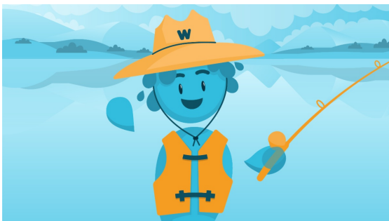
Water droplet Wade journeys through California's State Water Project

organized on August 16, 1965, servicing approximately 150 square miles and more than 45,000 service connections in Temecula, Murrieta, and parts of unincorporated Riverside County.