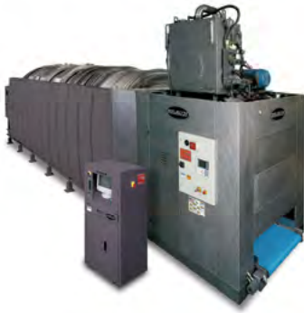
SmoothFlow® batch tunnel washer system by Braun http://www.gabraun.com/equipment.aspx?id=22 G.A. Braun, Inc.

Seek opportunities for water recovery and reuse to save energy, water, and detergent, while reducing harmful air emissions.