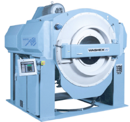
Large open pocket, end-loading washer/extractor

Air-quality concerns are causing the commercial dry-cleaning industry to change technologies and processes.