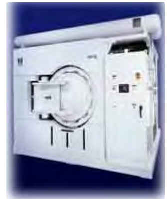
Dry cleaning machine